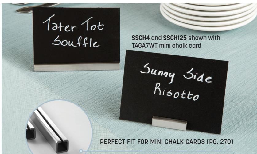
SSCH4 and SSCH125 shown with TAGA7WT mini chalk card

PERFECT FIT FOR MINI CHALK CARDS (PG. 270)